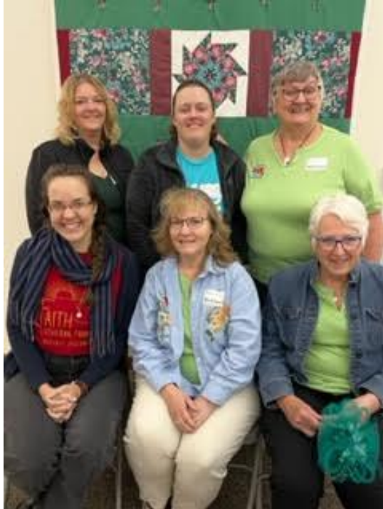
2024 -2025 Board Members